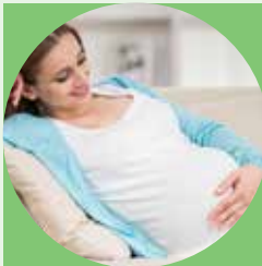
EARLY PREGNANCY CARE